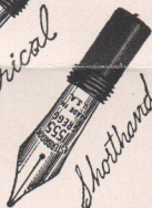
1555 Shorthand n. G.