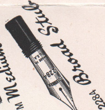
2284 Broad Strip